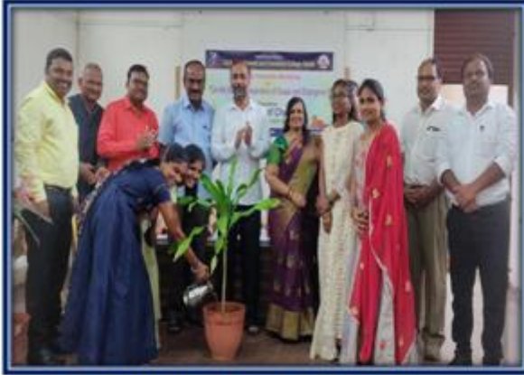
Inauguration of the workshop